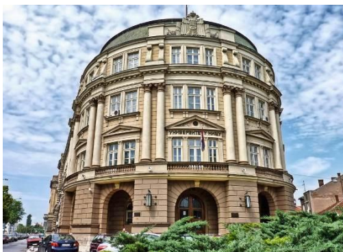
University of Niš

UNIVERSITY OF NIŠ FACULTY OF CIVIL ENGINEERING AND ARCHITECTURE